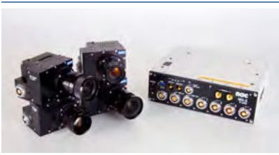
MX-5 Four (4) Camera Port Unit